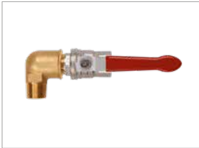
Image: Ball valve