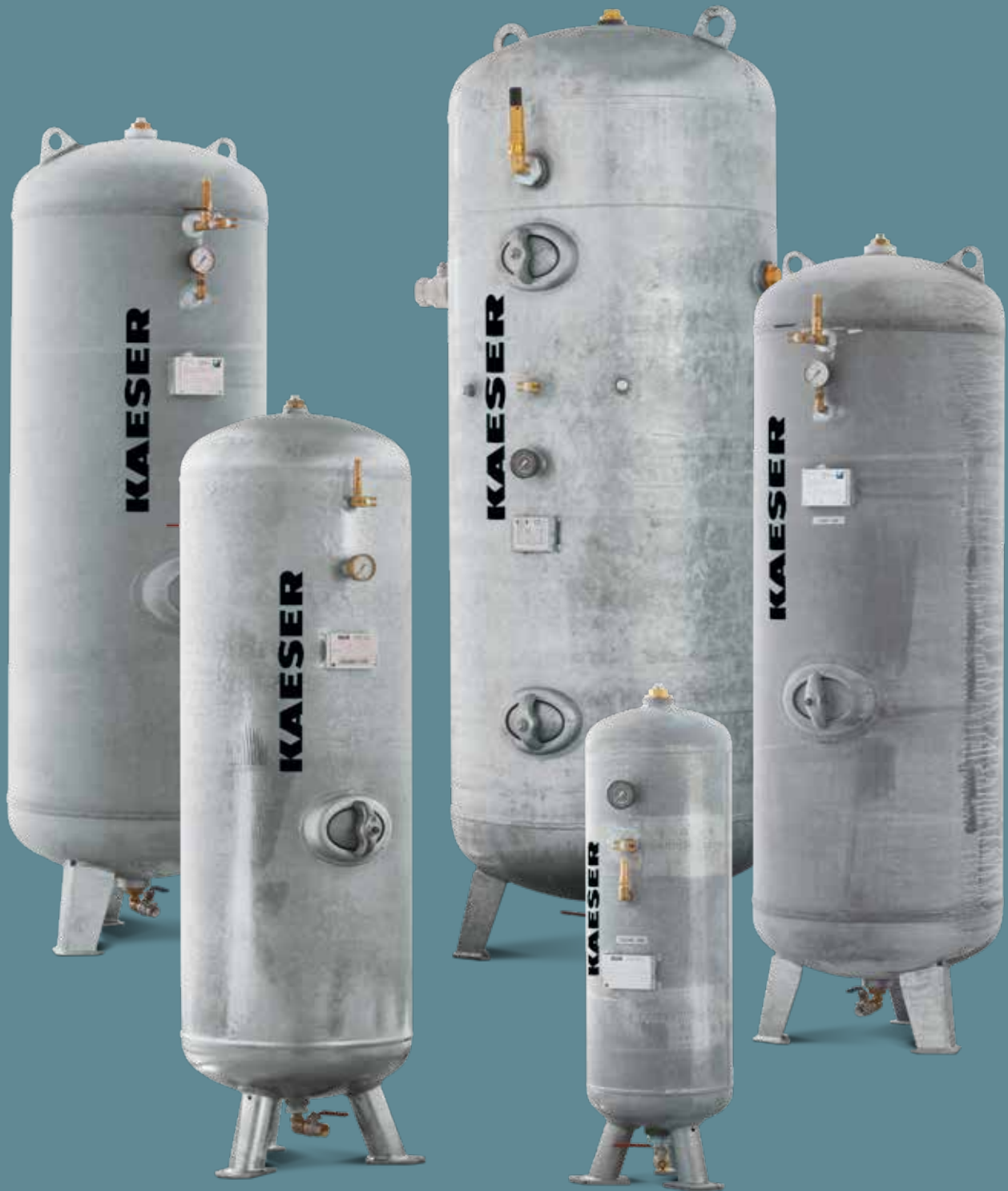
Vertical air receiver, hot-dip galvanised