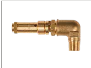
Image: Safety valve